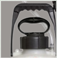
Built-in Fold Away Carry Handle with Wand Holder (GP Series)

26031XP / 26021XP / 26011XP 4" wide opening for easy filling and cleaning Auto pressure relief valve Backpack style shut-off/wand Include brass adjustable, poly fan and cone nozzles Viton® Equipped* 1, 2, 3 Gal capacities