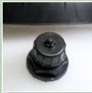
Automatic Pressure Relief Valve

26031XP / 26021XP / 26011XP 4" wide opening for easy filling and cleaning Auto pressure relief valve Backpack style shut-off/wand Include brass adjustable, poly fan and cone nozzles Viton® Equipped* 1, 2, 3 Gal capacities